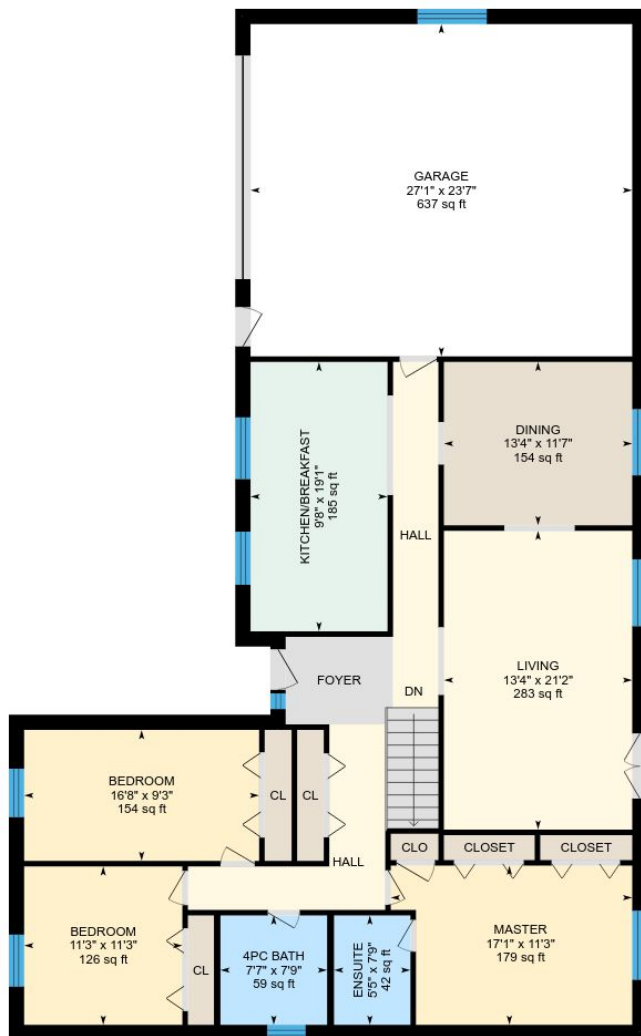
Main Floor Exterior Area 1794 sq ft

Main Building: Total Exterior Area Above Grade 1794 sq ft