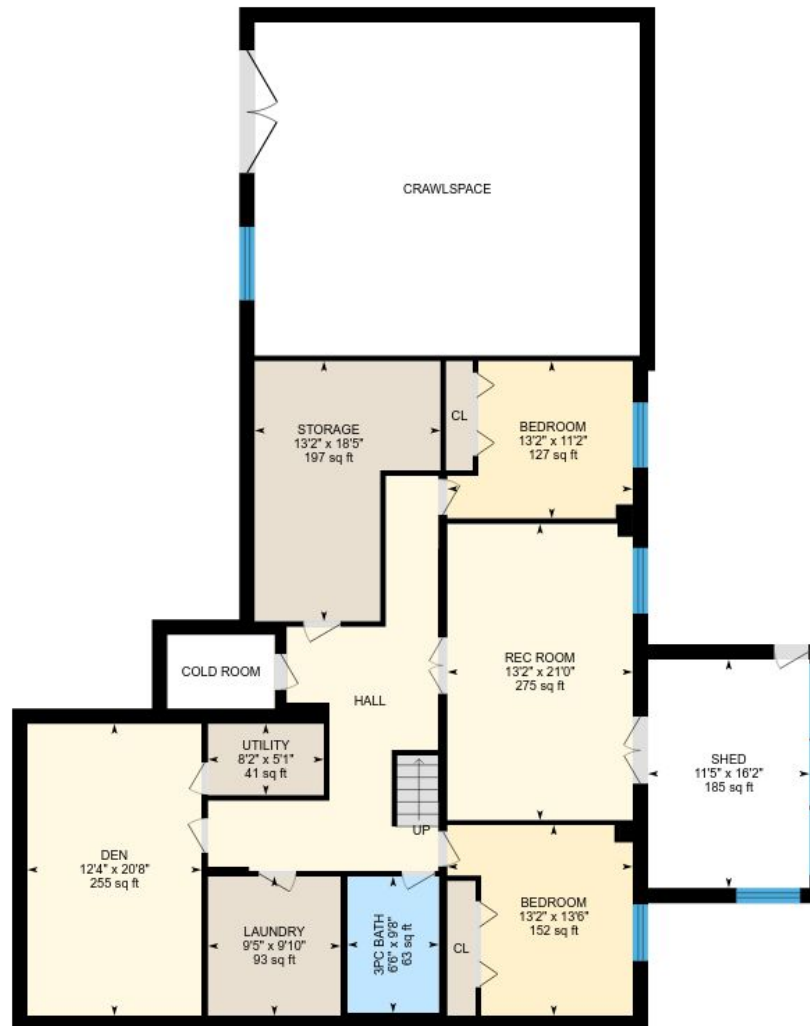
Basement (Below Grade) Exterior Area 1762 sq ft