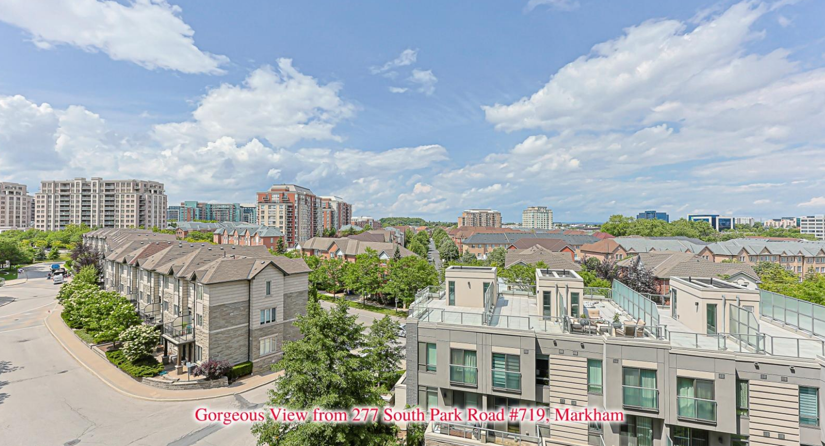
Gorgeous View from 277 South Park Road #719, Markham

WELCOME TO 277 SOUTH PARK ROAD #719, MARKHAM