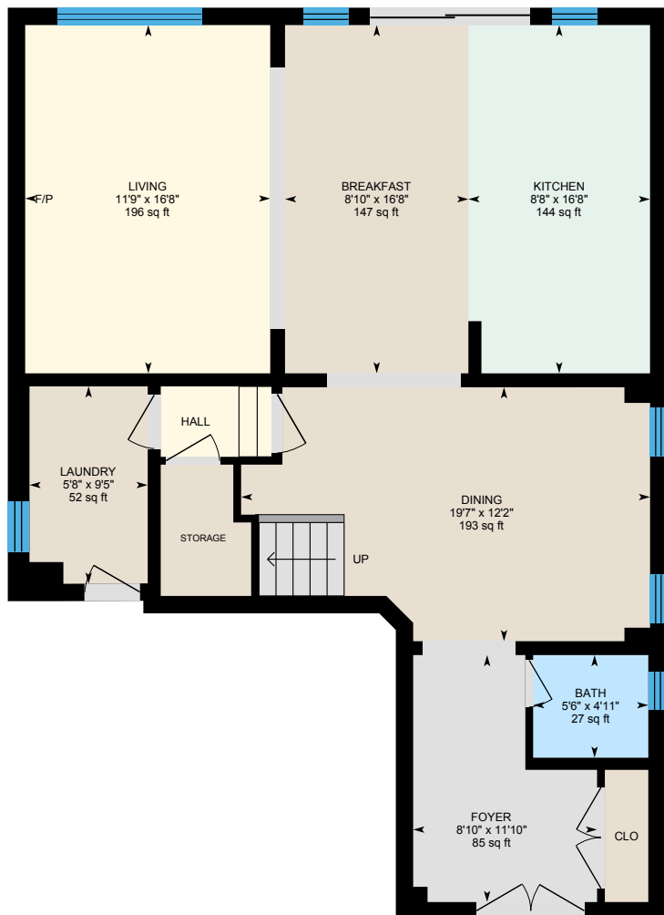
Main Floor Exterior Area 1102.32 sq ft

Main Building: Total Exterior Area Above Grade 2451.36 sq ft