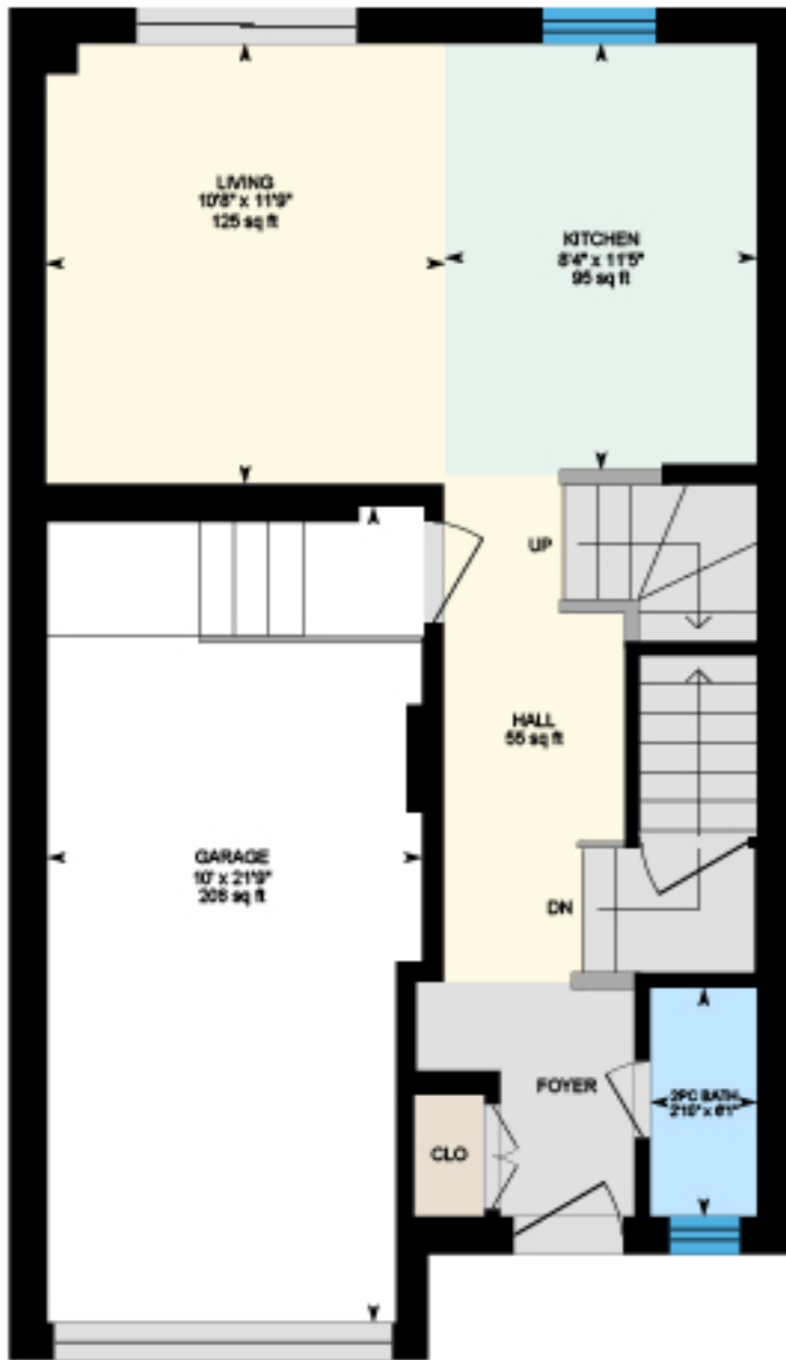
Main Floor Exterior Area 487.65 sq ft

Main Building: Total Exterior Area Above Grade 1201.27 sq ft