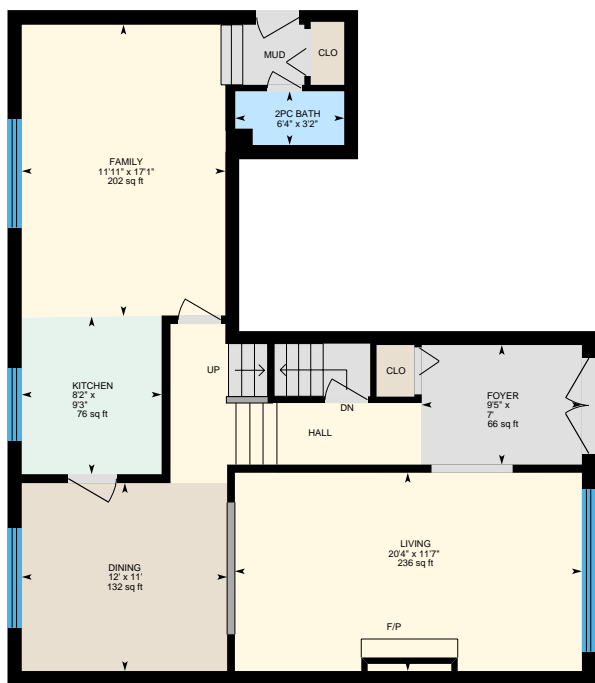
Main Floor Exterior Area 1031.36 sq ft