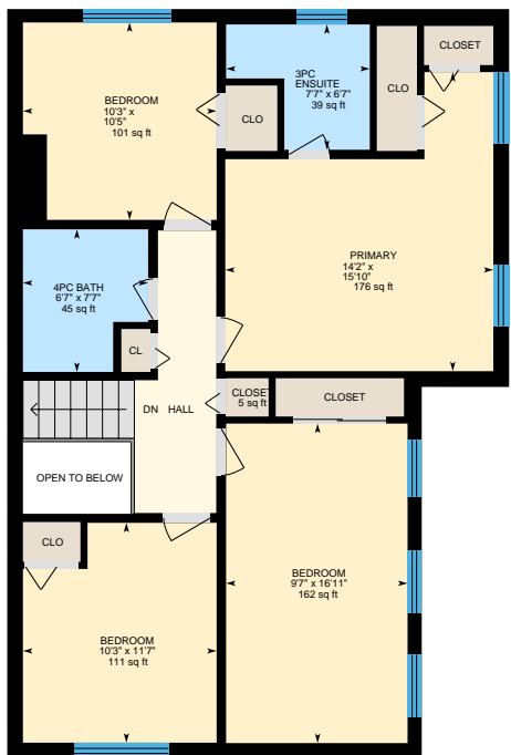
2nd Floor Exterior Area 942.43 sq ft